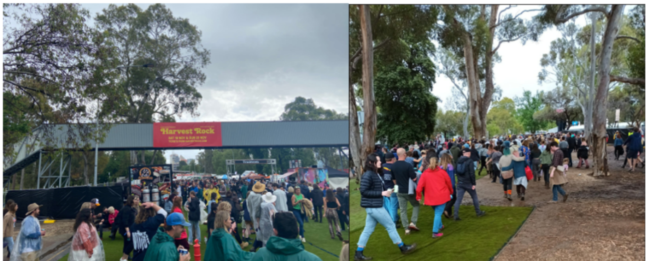
Figure 2. Images of people movements observed on the roadway at Harvest Rock 2022